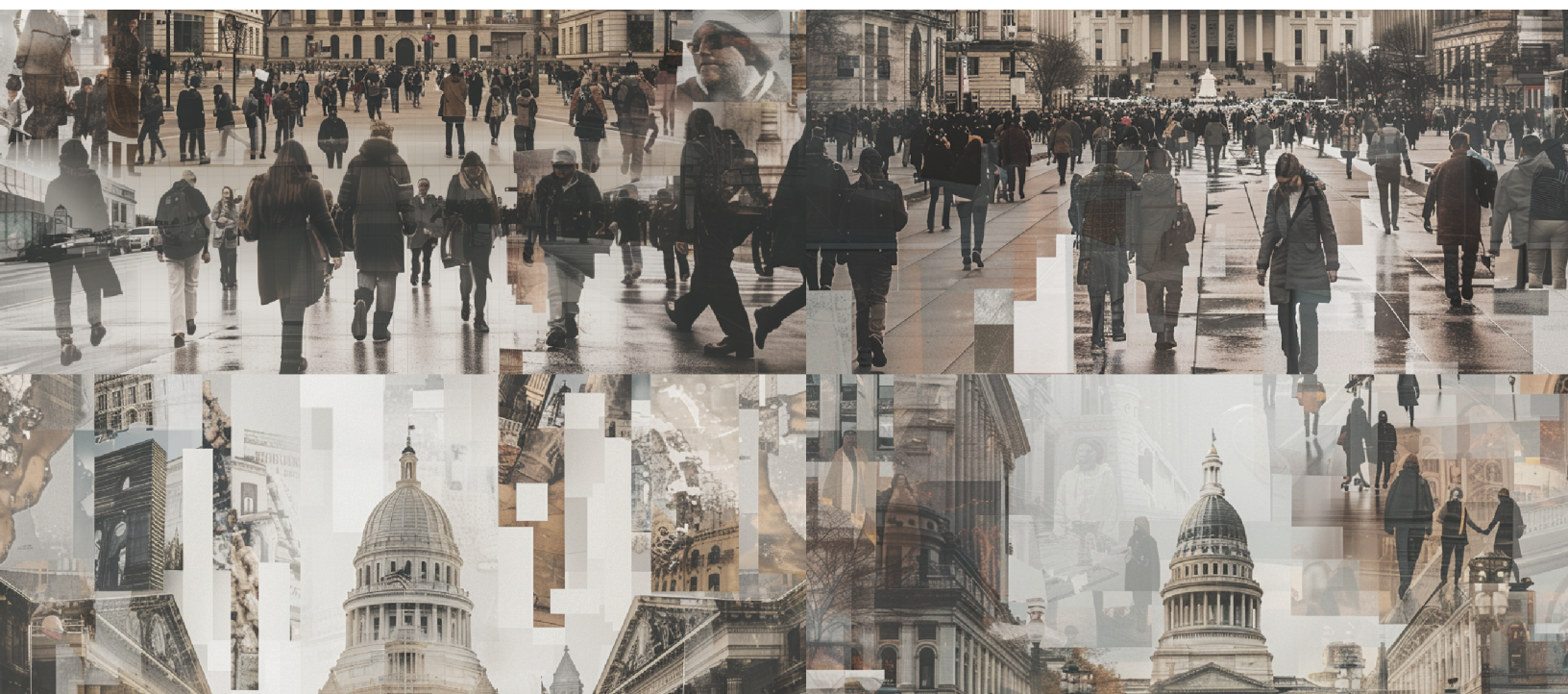
Legislative updates shared for members.